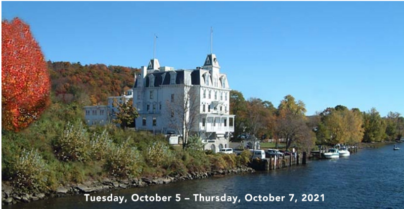
Tuesday, October 5 – Thursday, October 7, 2021

Please join us for this exciting motor coach tour to the CT Mystic Seaport area. This trip includes round-trip transportation, 2 nights at the Hilton Garden Inn, 4 meals, Essex Steam Train ride followed by a cruise on the CT River on the old-time riverboat, The Becky Thatcher , Mystic Seaport Museum, wine-tasting and more, plus taxes and gratuities. $599 per person, double occupancy. All during a fantastic fall foliage background!